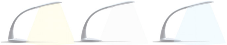
Warm White 2800K

What makes Stella Lighting products so unique is we offer three color spectrums of light in one lamp.